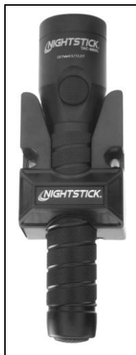
TAC-660XL Dual Switch Rechargeable Tactical Flashlight