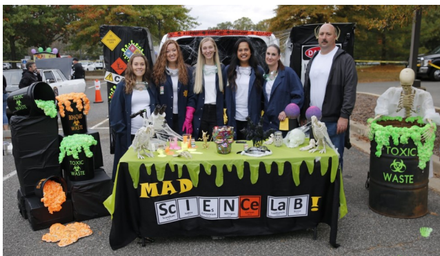
2021 — 1st Place Winner Forensic Science Unit

November 15th: Citizens Advisory Meeting at 7pm.