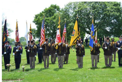
Charles County Sheriff's Office Honor Guard.

PROFESSIONALISM We believe in delivering a level of service which will reflect the pride we have in our community and organization.