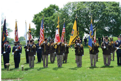
Charles County Sheriff's Office Honor Guard.

PROFESSIONALISM We believe in delivering a level of service which will reflect the pride we have in our community and organization.