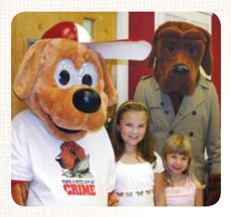
Two young girls meet McGruff the Crime-Fighting Dog and his nephew, Scruff.