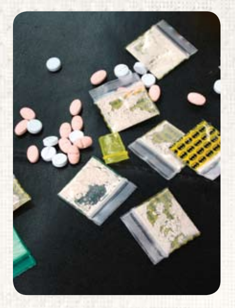
Many drugs are confiscated by diligent narcotics detectives.