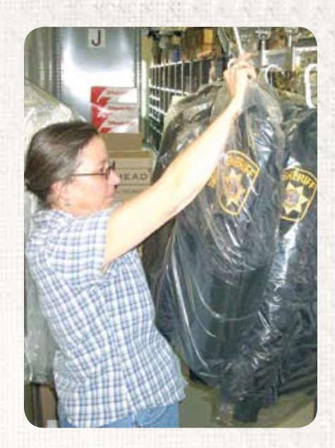
Uniforms, and many other supplies, are inventoried at the Quartermaster