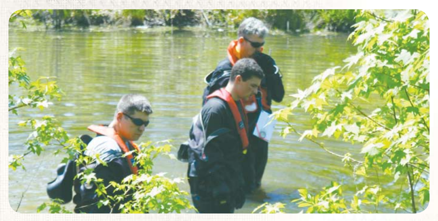
The Charles County Dive Team helps Major Crimes detectives search for evidence

identifies and analyzes biological stains and examined more than 900 cases in 2006 for possible serological evidence.