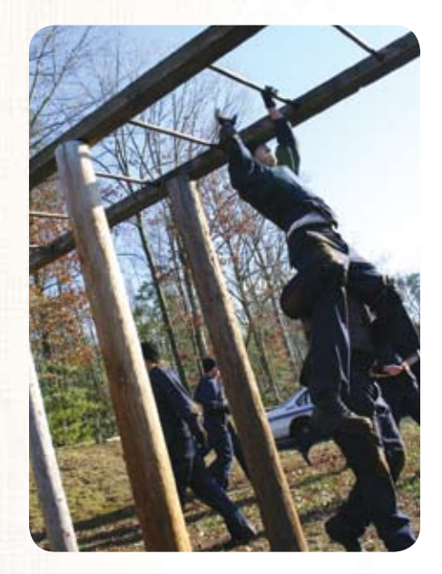
Recruits participate in an intense physical workout at the Academy

"In October, the Sheriff's Office officially opened its renovated firearms range at the Southern Maryland Pre-Release Unit."