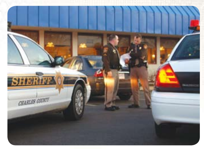
Officers Colby Shaw and Charles Gass investigate a possible stolen vehicle