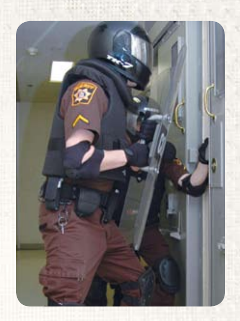
The ERT provides a quick and effective response to emergencies at the Detention Center.