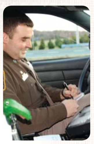
Officer John Long issues a citation during a traffic stop.

When patrol deputies respond to emergencies, they not only have to be quick; they have to navigate the roads cautiously and listen closely to new information being dispatched as well. Ensuring a swift and safe response requires extensive training but this skill, combined with the high number of deputies conducting patrols in the community, often leads to the quick apprehension of criminals.