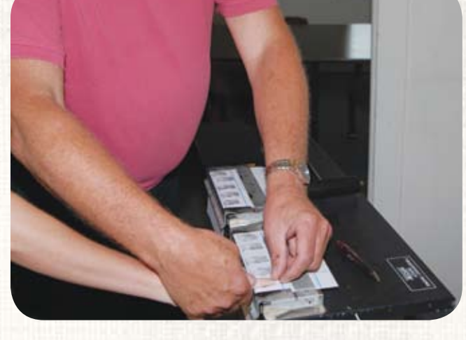
Potential employees are fingerprinted during their background investigations

Each year, the Human Resource Section also coordinates the Agency-wide collection of back-to-school supplies and Christmas gifts for the young men who live at the Maryland Sheriffs' Youth Ranch, a facility sponsored by the Maryland Sheriffs' Association to help disadvantaged and at-risk young men become productive citizens.