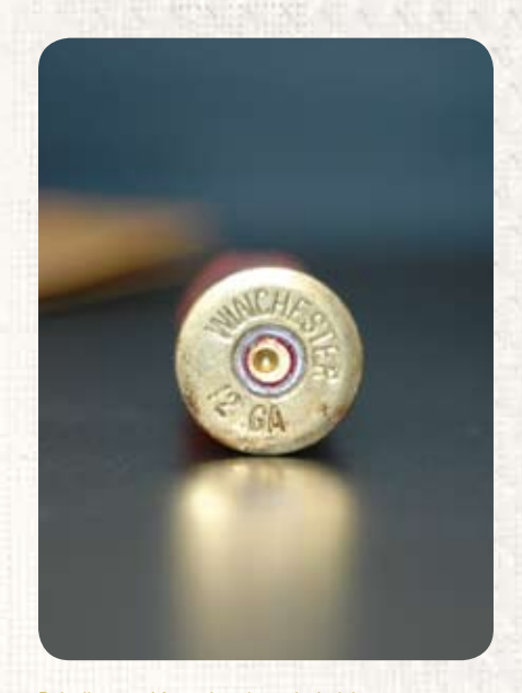
Detectives and forensic science technicians painstakingly search for and analyze evidence like this.