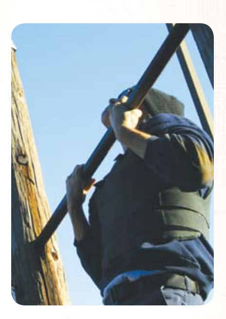
A recruit tests his strength with pull-ups