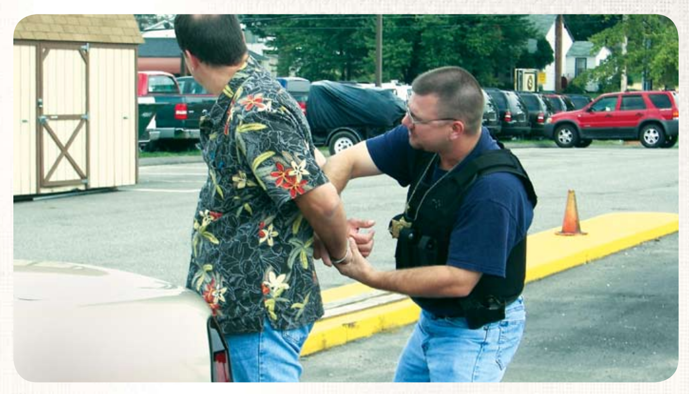
Warrant officers find fugitives attempting to avoid arrest

other civil process matters. In 2006, the unit handled 1,321 evictions, 5,635 landlord complaints, 435 postings and 76 writs of execution and processed 16,863 summonses. The unit served 14,705 civil documents, netting the Agency $117,060 in service reimbursement.