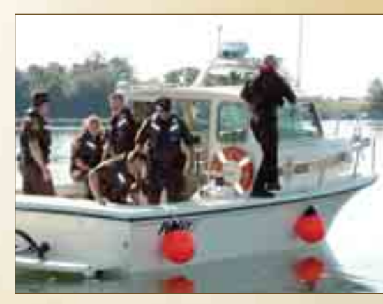
The crew of the Security Response Vessel did not deploy during 2004, but they trained in varying weather conditions to ensure they are ready to respond to emergencies and operations that take place on Charles County waterways.