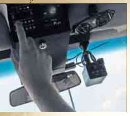
When officers activate the emergency equipment in their cruisers, lights flash, sirens wail and, beginning in 2004, video cameras start recording. The video can be used as evidence in court, protects officers and citizens if a complaint is filed and assists officers as they write reports.