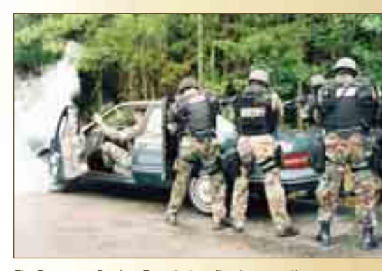
The Emergency Services Team trains often to ensure they are always ready to handle high-risk operations.