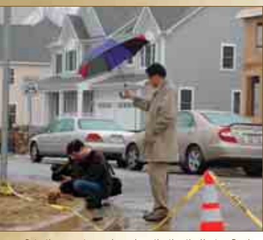
Detectives spent many hours investigating the Hunters Brooke arson. After detectives completed the on-scene portion of the investigation, reporters had their first chance to survey and report on the damage from the scene.