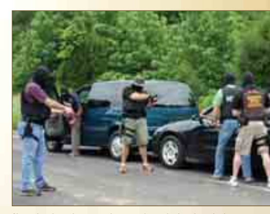
Narcotics detectives must be not only tactical and meticulous, but also anonymous. Here, as detectives demonstrate how they would seize a vehicle and apprehend a suspect, they wear masks to protect their identities.