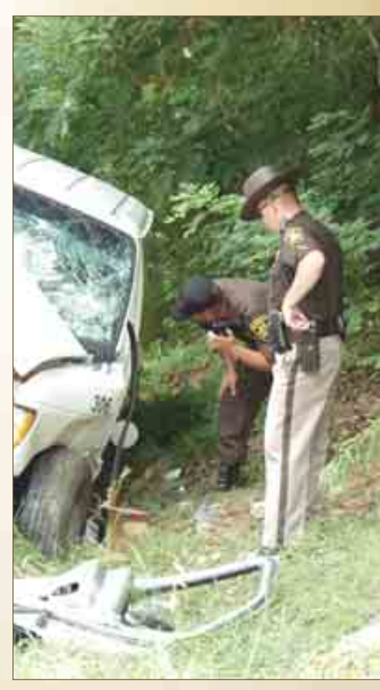
In July, a group of teens fleeing the scene of a burglary were involved in a crash that killed one of the teens and an innocent civilian. The teens were charged with two counts of felony murder because the burglary, a felony, resulted in two deaths.