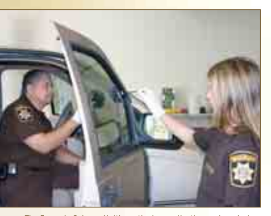
The Forensic Science Unit's meticulous collection and analysis of evidence has resulted in the successful closure of countless criminal investigations.

In 2004, detectives executed 11 search and seizure warrants in connection with burglaries and thefts. As a result, the detectives recovered thousands of dollars worth of stolen property in connection with the 210 burglaries and 23 felony theft incidents they investigated.